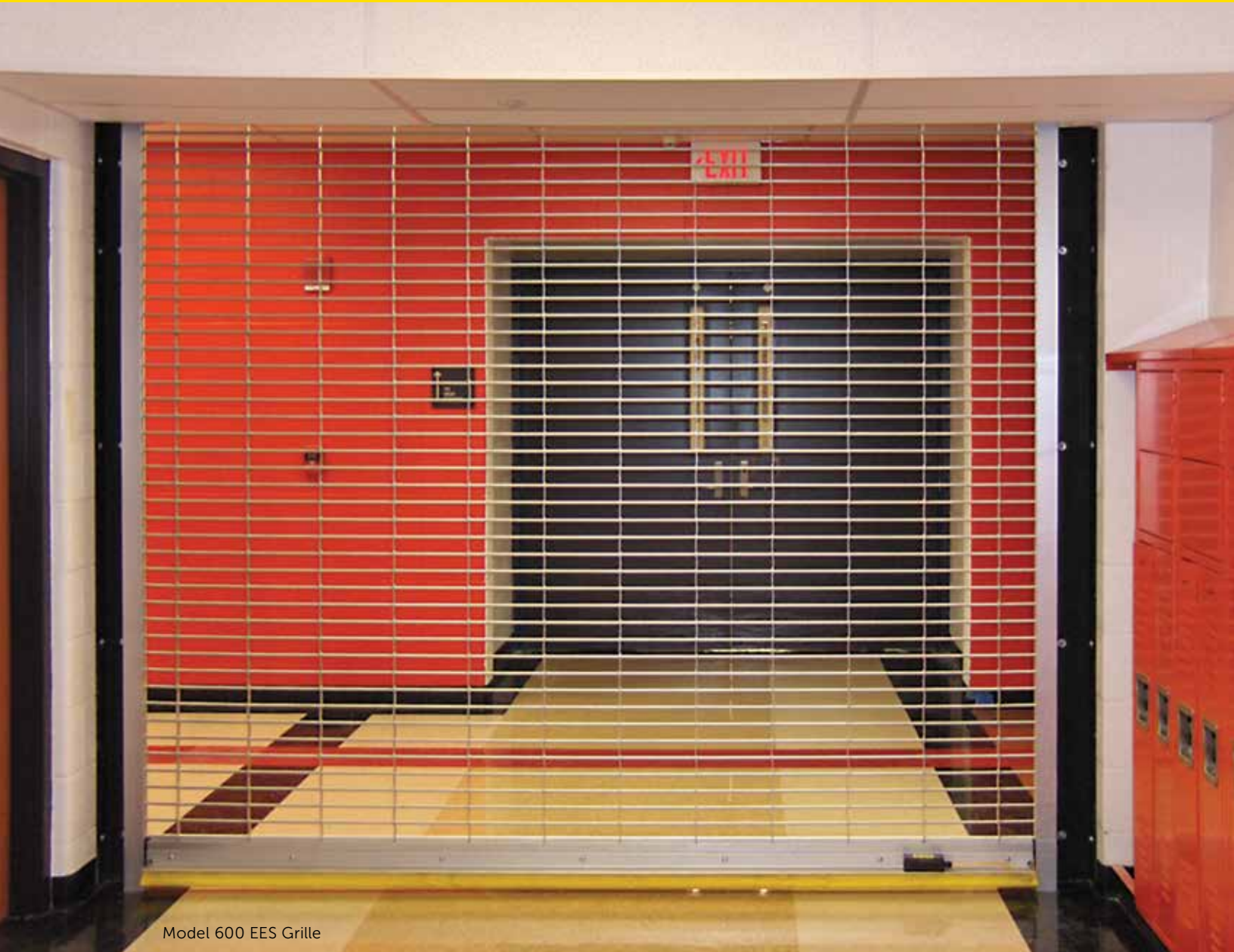
Model 600 EES Grille

Wayne Dalton's comprehensive collection of commercial doors are ideal for government and other public facilities where security and ease of access are paramount.