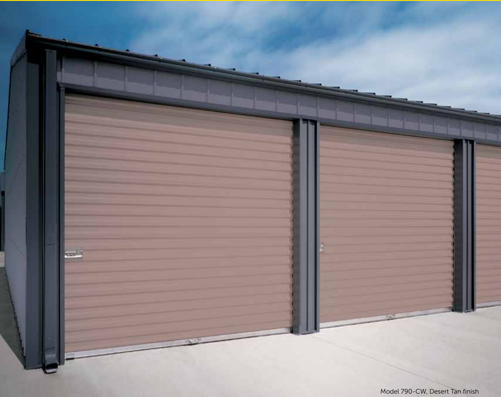
Model 790-CW, Desert Tan finish