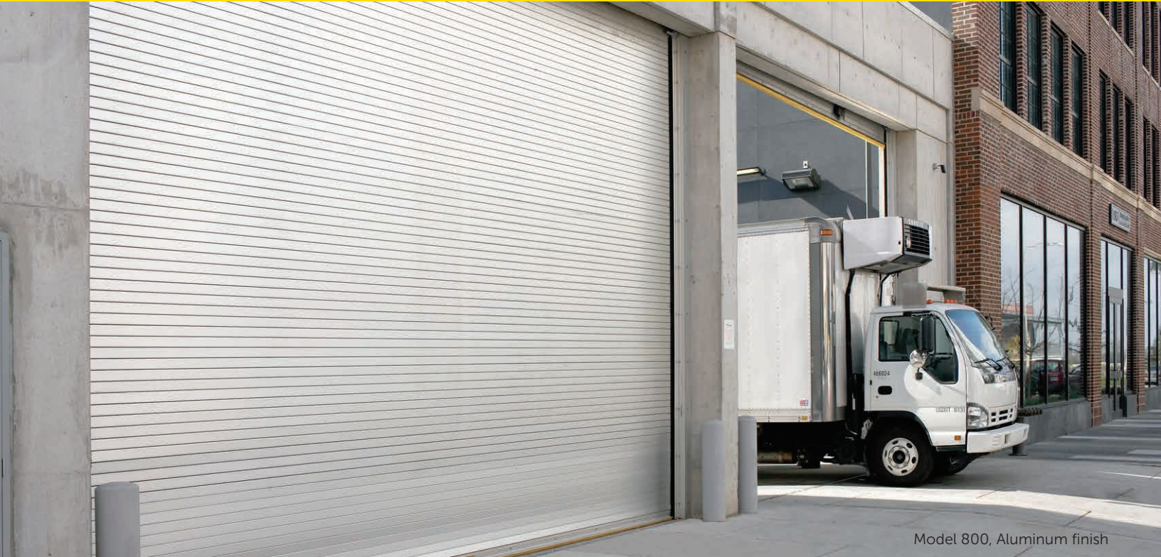
Model 800, Aluminum finish