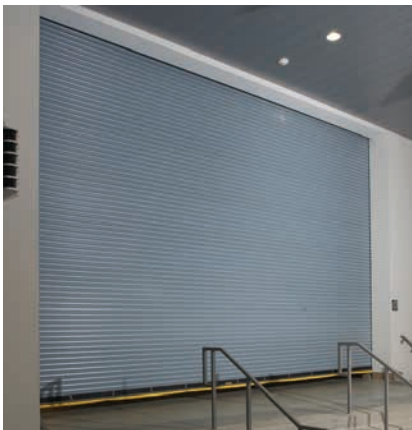
No. 4 slat

Secur-Vent® – Perforated slat provides optimal security and ventilation. Slat consists of \frac{1}{16} " diameter holes offering 17% open area over length of each slat. Available in No. 14 flat slat up to 22' wide x 20' high (available in 20-gauge steel only).