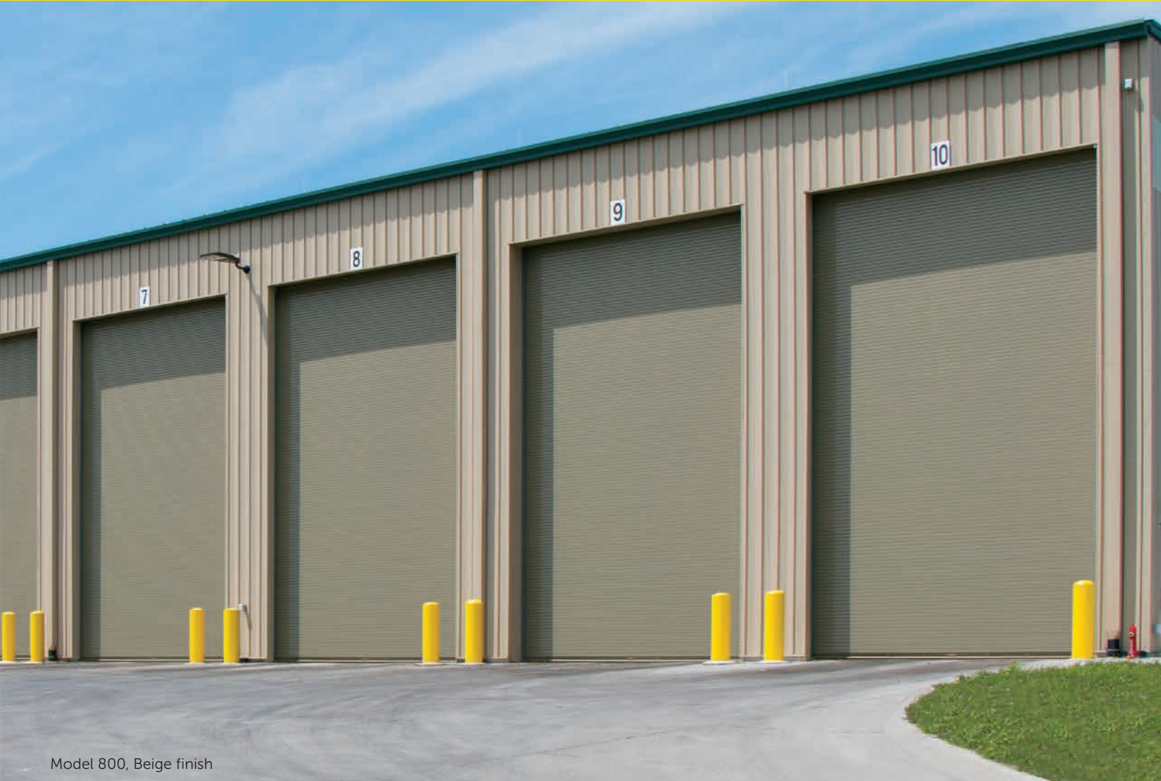
Model 800, Beige finish