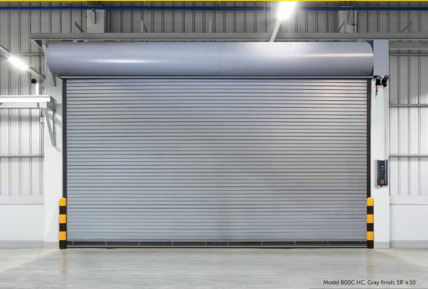
Model 800C HC, Gray finish, 18' x 10'