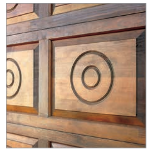
Carved Raised Panel Designs (optional)

Double-car designs look like two single-car doors together