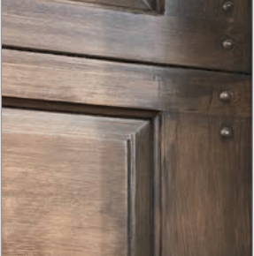
Ends are thru-drilled for carriage bolts