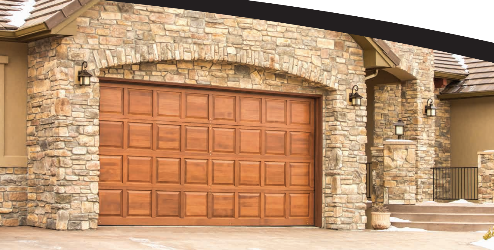
300 Series, 4-8 panel, Custom stain finish

RAISED-PANEL WOOD West Region Availability