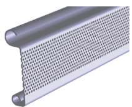
No. 14 Slat Profile - Secur-Vent®