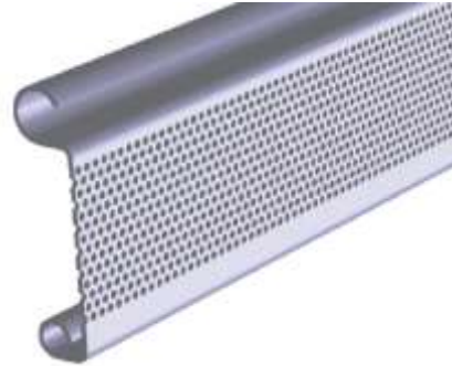
No. 14 Slat Profile – Secur-Vent®