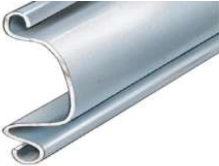
No. 4 Slat Profile