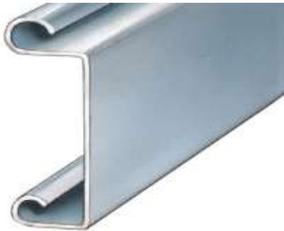
No. 14 Slat Profile